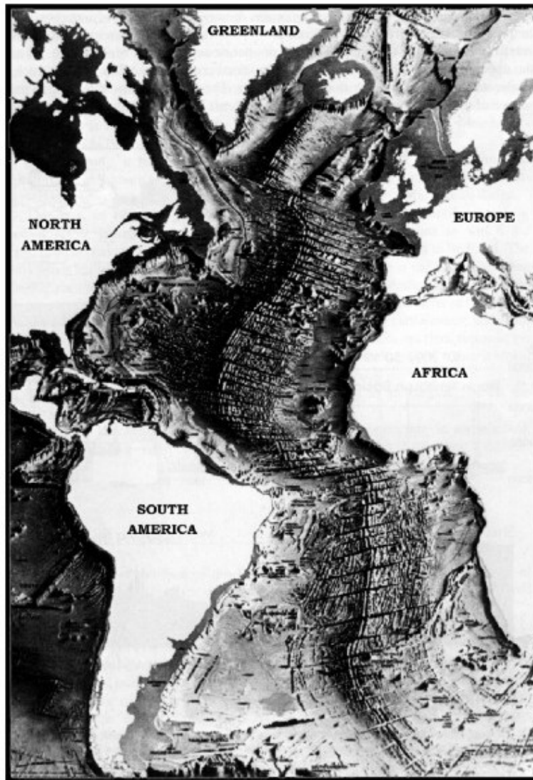
Figure 2: Morphological diagram of the Atlantic ocean floor, from a painting published by National Geographic Society (U.S.A.) based on bathymetric studies of B. C. Heezen and M. Tharp.

The most conspicuous morphological feature is the magnificent continuous mountain range near the center of the Atlantic, called the mid-Atlantic ridge. This continuous range extends to the Pacific, Indian and Arctic Oceans and encircles the whole Earth, with a total length of about 65,000 kilometers. The mid-Atlantic ridge is symmetrical and occupies about one third of the sea floor of the Atlantic Ocean. With the mid-Atlantic ridge, the deepest parts of the Atlantic Ocean do not occur in its middle as one might expect.